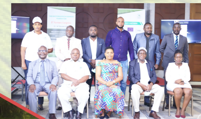
EAFF Board Members Group Photo 2020 - 2024