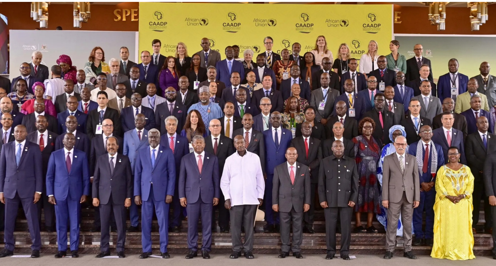
Africa leaders at the Comprehensive Africa Agriculture Development Programme (CAADP) held at Munyonyo Commonwealth Resort.