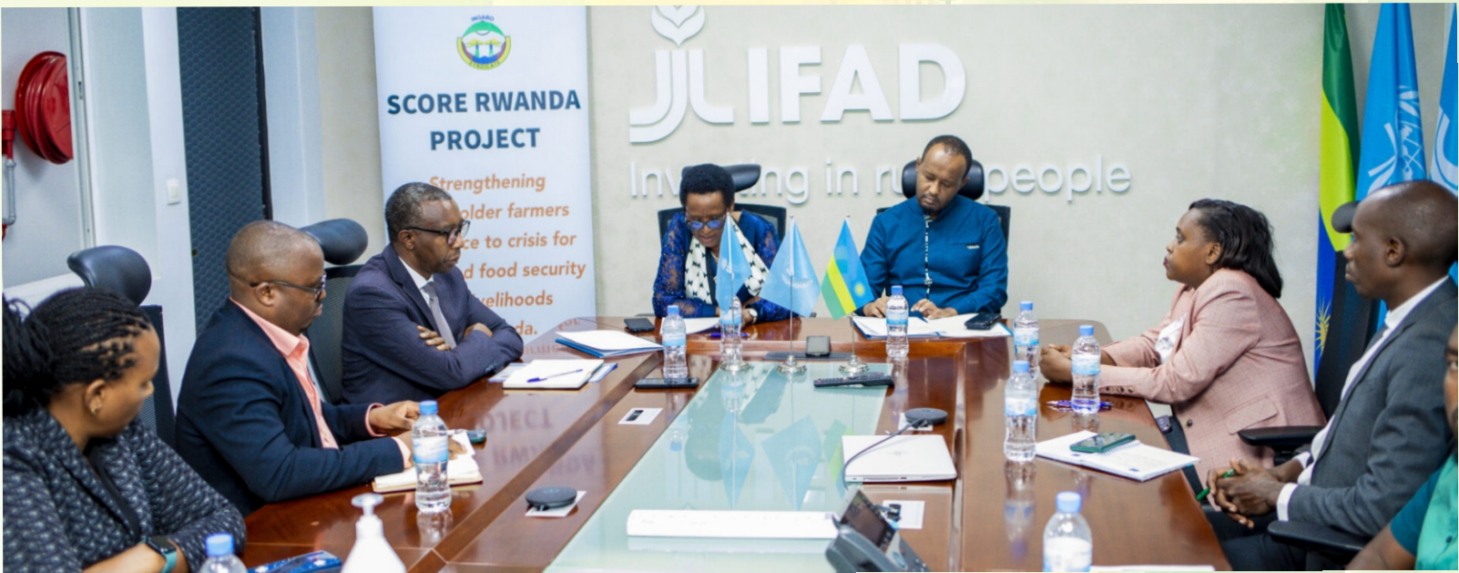
Ingabo Farmers Syndicate officials with IFAD officials during the agreement signing at IFAD Offices in Rwanda

For the past 42 years, IFAD has been actively investing in rural communities in Rwanda, empowering them to reduce poverty, enhance food security, improve nutrition, and build resilience against economic and environmental challenges.