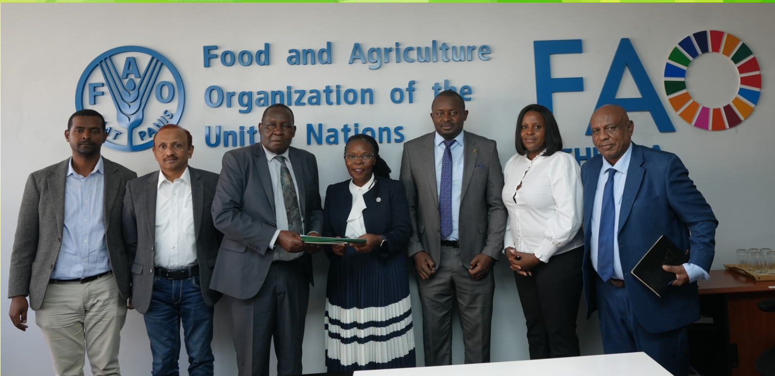
EAFF Delegation with FAO officials pose for a group photo after the courtesy meeting

A s part of its strategic vision for a prosperous and cohesive farming community, the Eastern Africa Farmers Federation (EAFF) recently conducted a high-level visit to Ethiopia. This initiative aligned with EAFF's commitment to transforming smallholder agriculture into a profitable and sustainable investment opportunity.